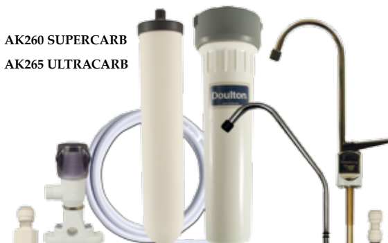
AK260 Doulton Supercarb Kit AK265 Doulton Ultracarb Kit

Complete kit ref AK260 with housing, Supercarb candle, duo spout faucet, saddle valve, tube, instructions etc. Also available with Ultracarb candle - AK265.