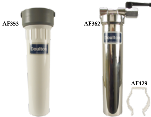
AF353 Plastic Housing 3/8" Speed-fit AF362 Stainless Housing w/valve AF429 Clip for F362

Doulton plastic housing (HIP) incorporates 3/8" push-fit fittings and comes with bracket. Stainless housing (HIS) has 1/2" BSP female threads and comes with shut-off valve. Both housings take any of the candles shown on the right with the short mount.