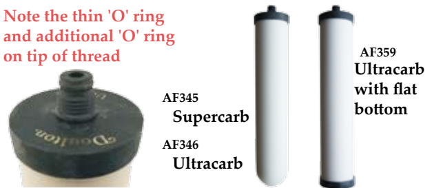
AF345 Supercarb Candle for Franke 10" AF346 Ultracarb Candle for Franke 10" AF359 Ultracarb for Franke w/flat bottom 10"

Note the thin 'O' ring and additional 'O' ring on tip of thread