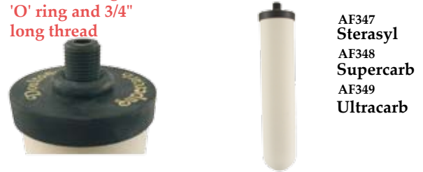
AF347 Sterasyl Candle 10" AF348 Supercarb Candle 10" AF349 Ultracarb Candle 10"

Note the doughnut 'O' ring and 3/4" long thread